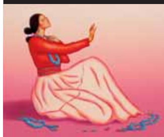
Gala's Ring, R.C. Gorman

328 San Felipe NW 800-388-2787 505-242-8008 riograndegallery.com