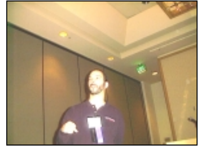
Brad and CORBA

(Note that CORBA Messaging is a separate Standard)